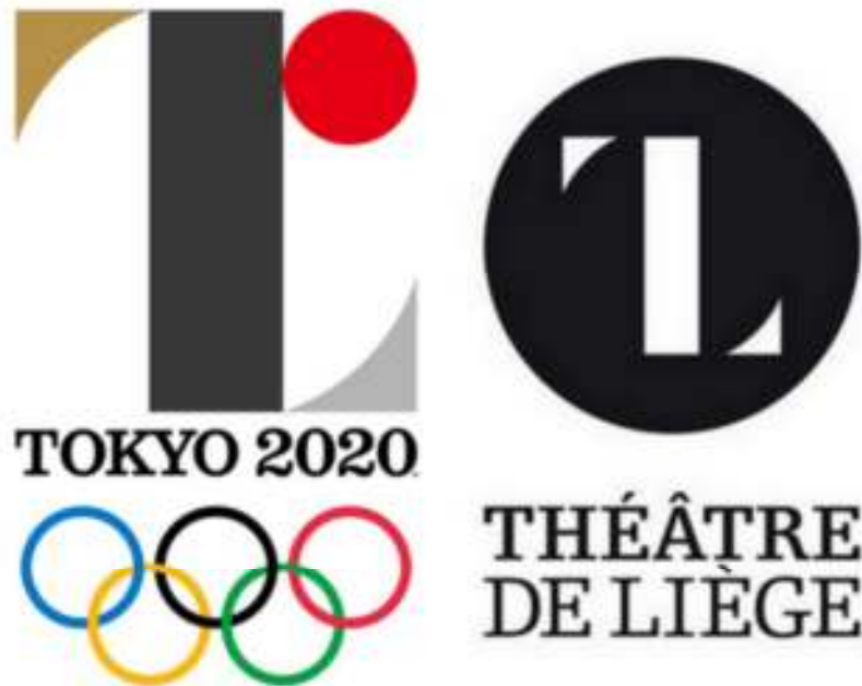
Tokyo 2020/ Theatre de Liege

Its withdrawal is a highly unusual move.